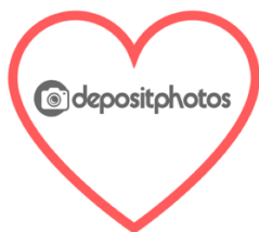
Photo Licensing for your website and marketing projects

What is it? Over 60 million high-quality royalty-free stock images and high-definition footage to fulfill all your creative needs for your website, marketing brochures, and so on.